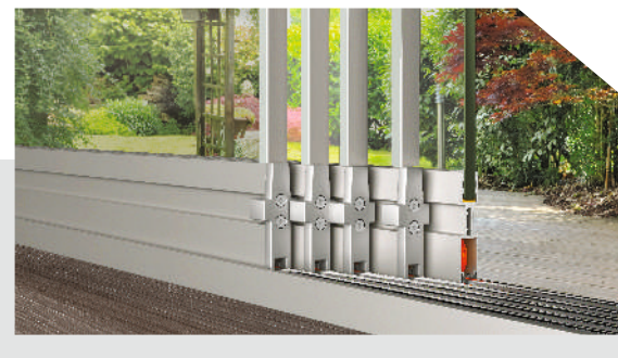
Minimal glass sliding system, optionally equipped with a ZIP Screen on the same side, enhancing the overall living