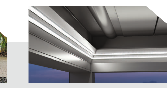
Dimmable LED lights applied on transoms and louvers, providing sufficient and stylish lighting at night.