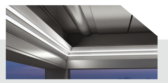
Dimmable LED lights applied on transoms, louvers and posts providing sufficient and stylish lighting at night.