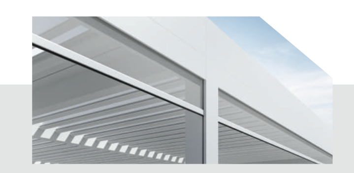
Fully integrated & automated ZIP Screens , offering an elegant solution for vertical shading.

Featuring 120 mm posts and a minimum drainage section of Ø50 mm, it blends aesthetic elegance with practicality, ensuring a sophisticated outdoor experience.