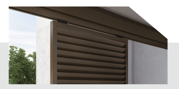
Top-hung sliding shutters , ideal for decorative shading solutions.

Thanks to the bioclimatic design philosophy, a wide range of sophisticated equipment can be additionally integrated to create controlled shading, ventilation, and temperature regulation. Our pergolas effectively expand your indoor space, transforming it into a versatile living area for year-round use.