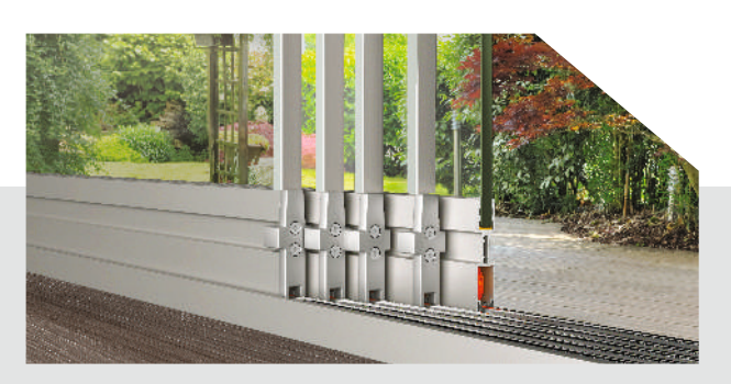
Minimal glass sliding system , optionally equipped with a ZIP Screen on the same side, enhancing the overall living experience.